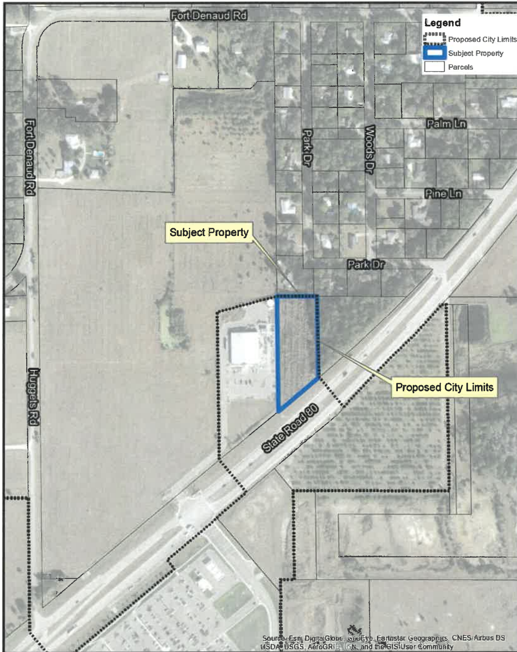
EXHIBIT C PROPOSED MUNICIPAL BOUNDARY MAP