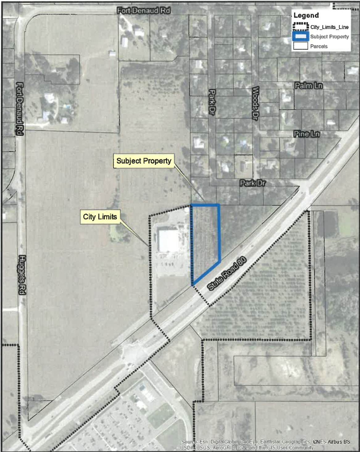
EXHIBIT B LOCATION MAP/CURRENT MUNICIPAL BOUNDARY MAP